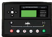
DSE-7320 Remote Control Panel